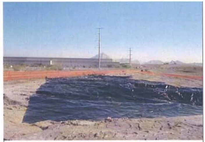
North West Detention Basin, Discolored Soils area. Covering with Plastic.