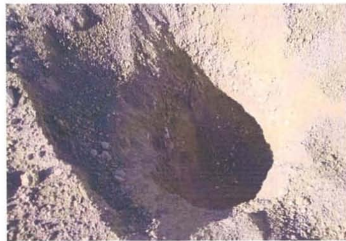
Second of four potholes hand dug. West of fence line off site. In channel.