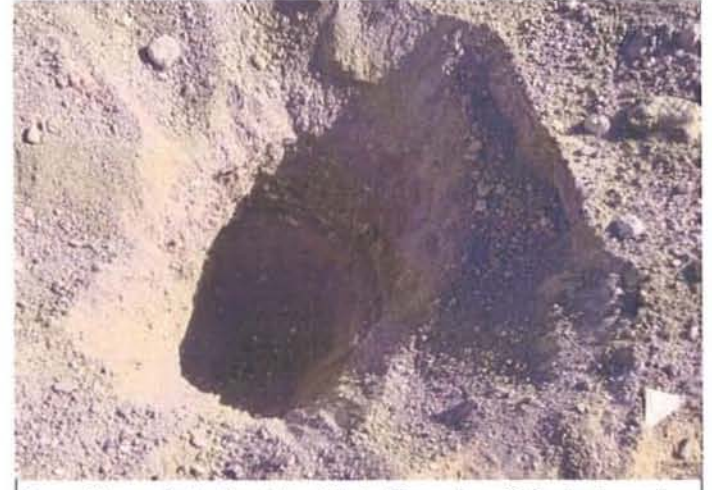
three of four pothole. Hand dug. West of fence line off site. In channel.