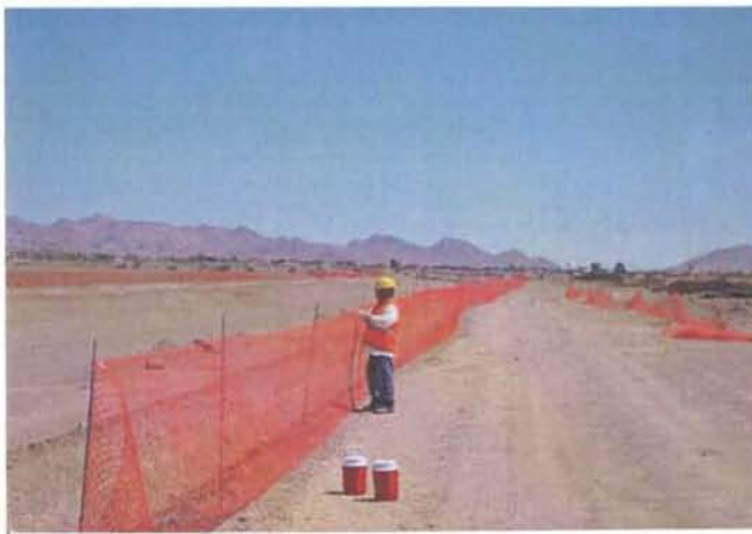
Eastside. Sewer realignment, fence installation.