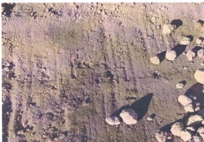
Eastside, SW-8, discolored soils. Being excavated from slopes.