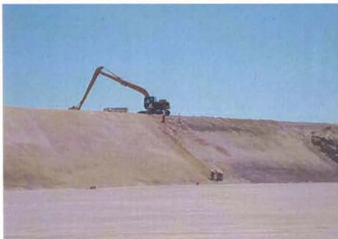
CAMU, Phase 1, East slope grading preparation for liner.