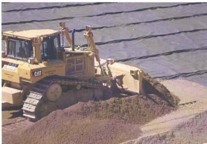
CAMU: Phase 1 Operations layer being placed.