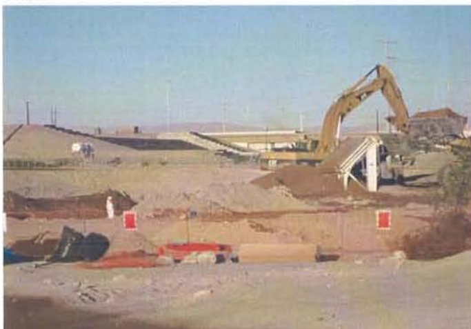
CAMU: Western Ditch excavation and screening operation.