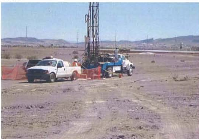
CAMU, Test boring for Shoring Plan.