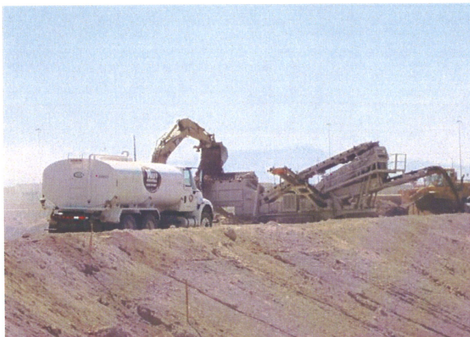
CAMU: Western Ditch Screening operation.