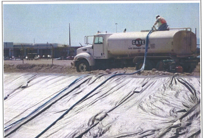
CAMU: Phase 1 dewatering sump.