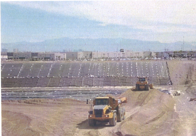
CAMU, Phase 1, operations layer placement.