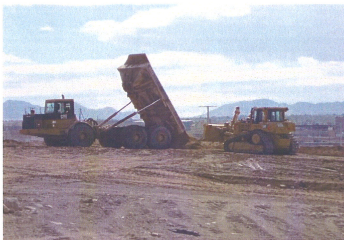
CAMU: 40 ton dump truck. Dumping soils on 200,000 cy stockpile.