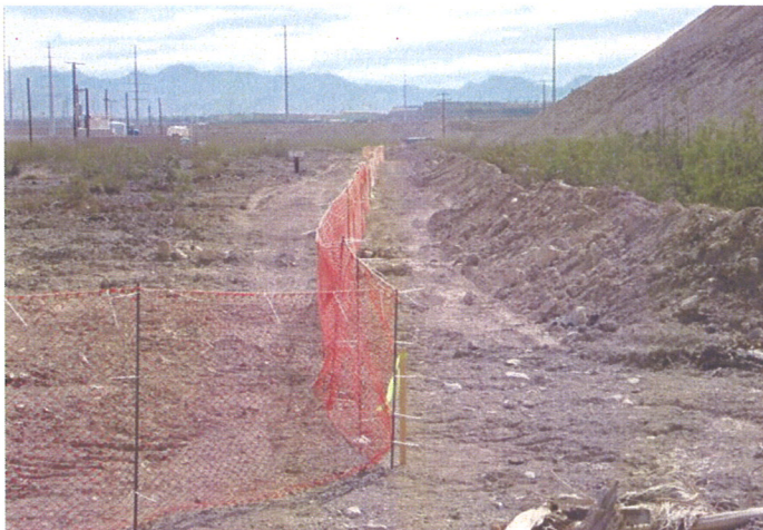
CAMU: Orange construction fence installed around 200,000 yd stockpile.