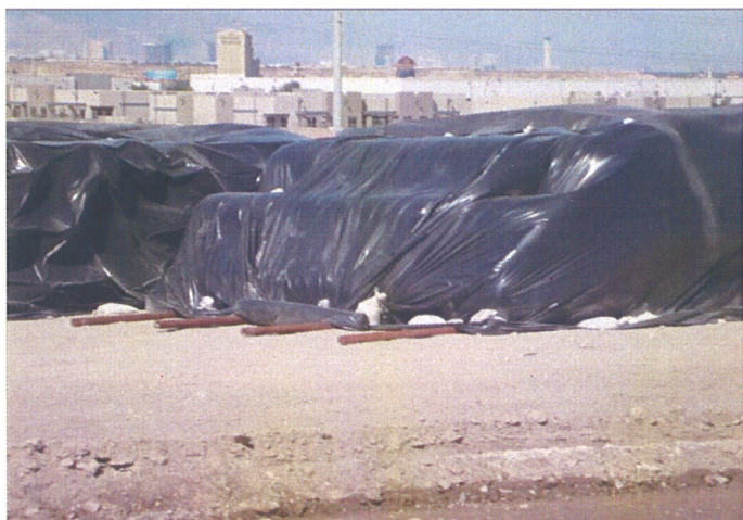
CAMU: Liner staged and covered after delivery.