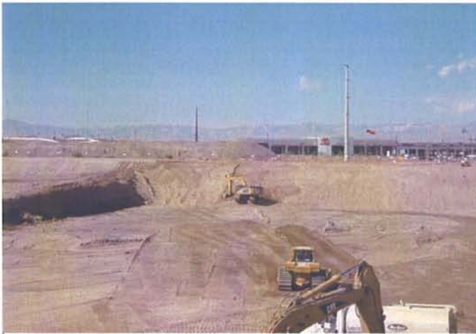
CAMU: Phase 2. Western ditch grading the floor.