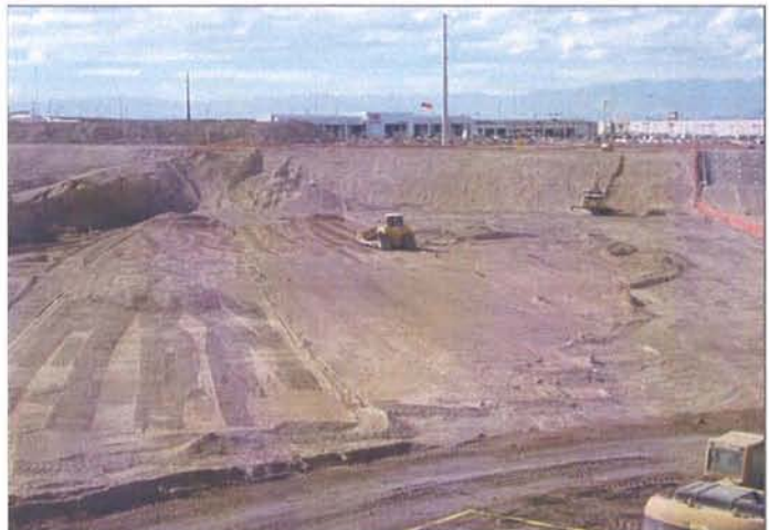
CAMU: Phase 2. Western ditch grading floor.