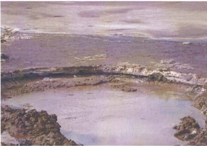
Eastside: SW-12. Crust over water.