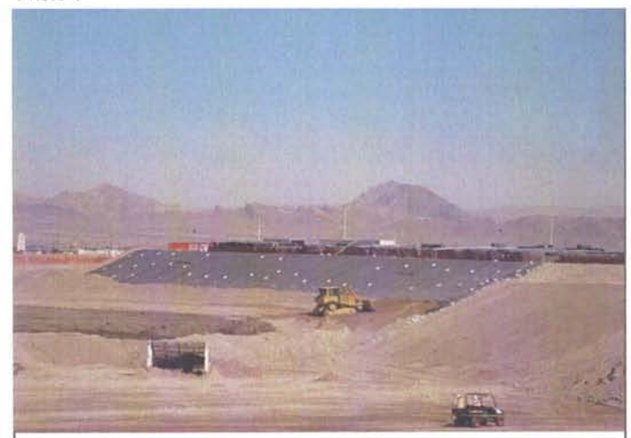
Eastside: Sprinkler System at 7A, dry ponds.