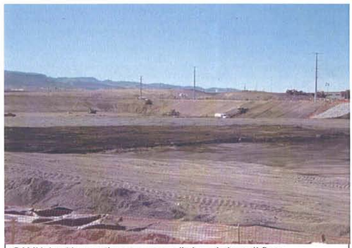
CAMU: Looking southeast western ditch and phase II floor phase II grading.