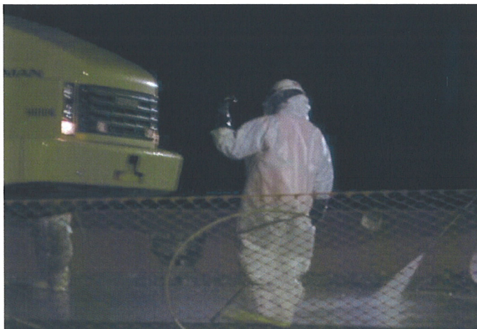
Eastside: Decon Pad.