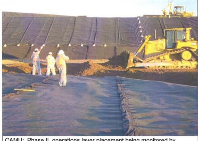
CAMU: Phase II, operations layer placement being monitored by Entact, Geosyntec, Weston.