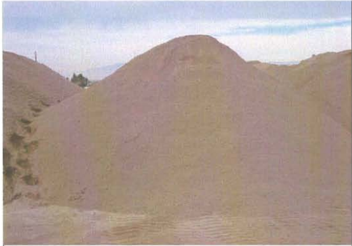
Eastside: WST-1, Powerscreened 1" minus, soils. Inspected by Weston.