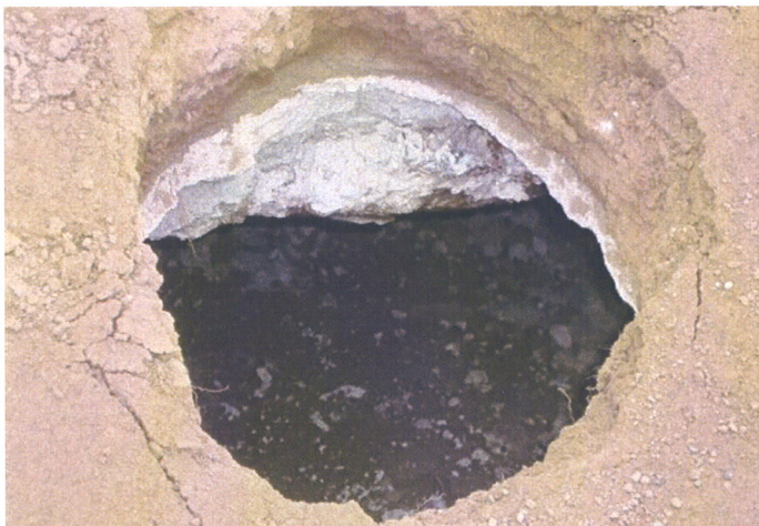
CAMU: BMI North Landfill Cap, Sink hole found while compact rolling.