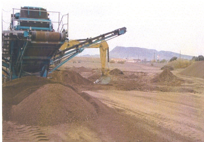
Eastside: Excavating and powerscreening WST-8, .