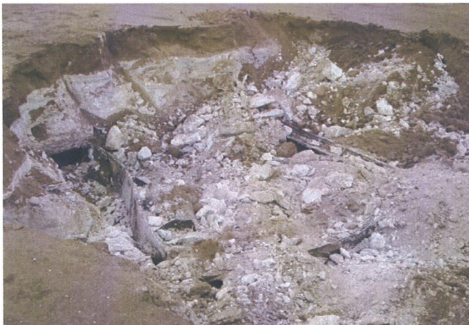
CAMU: BMI North Landfill Cap. Sink hole excavated.