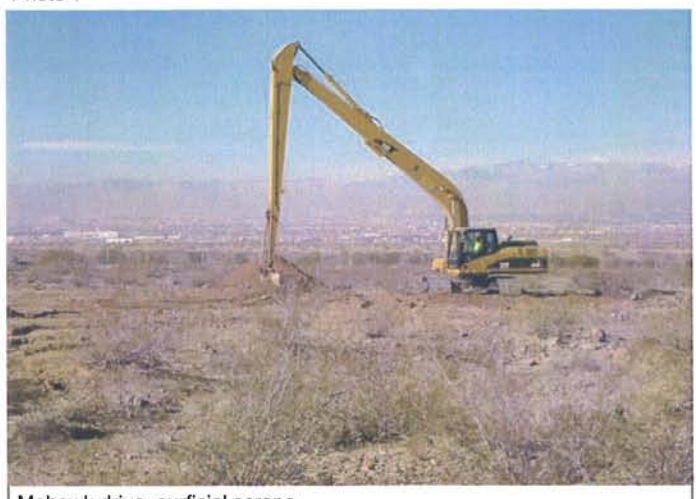
Mohawk drive, surficial scrape.