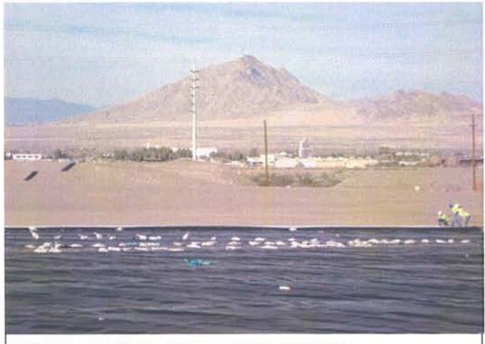
CAMU: North BMI Landfill geosynthetics, installation.