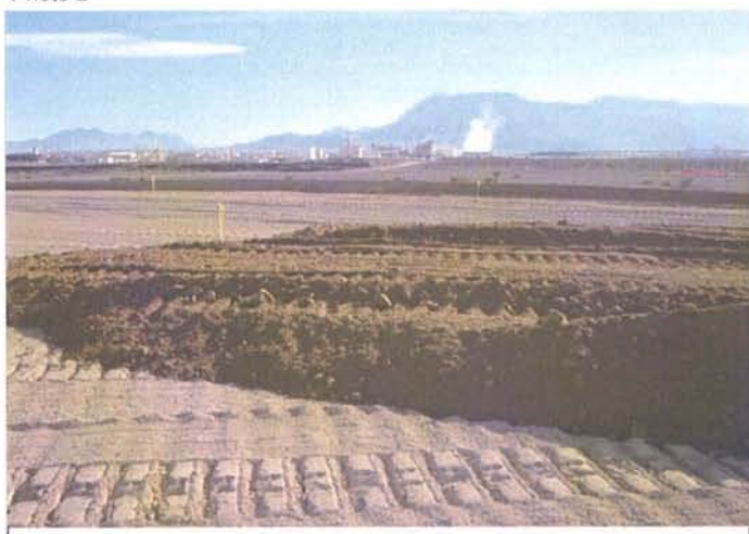
CAMU: North BMI Landfill second lift 6" minus placement.