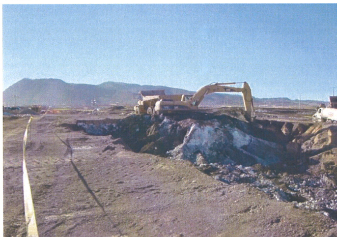
CAMU: NW Basin/Phase IIIB excavation, first 8 foot cut.