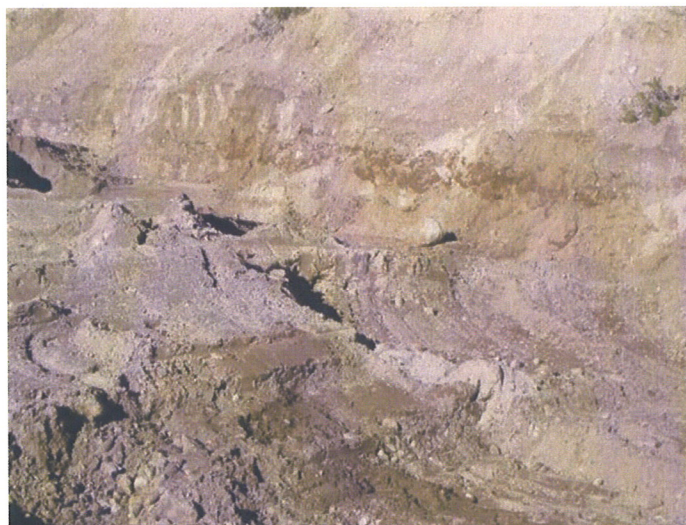
Eastside: PUB-4, addition excavation, removing discolored material only where needed.