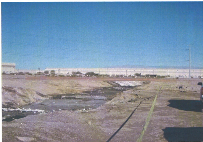
CAMU: NW Basin/Phase IIIB excavation, next cut. Looking Northwest.