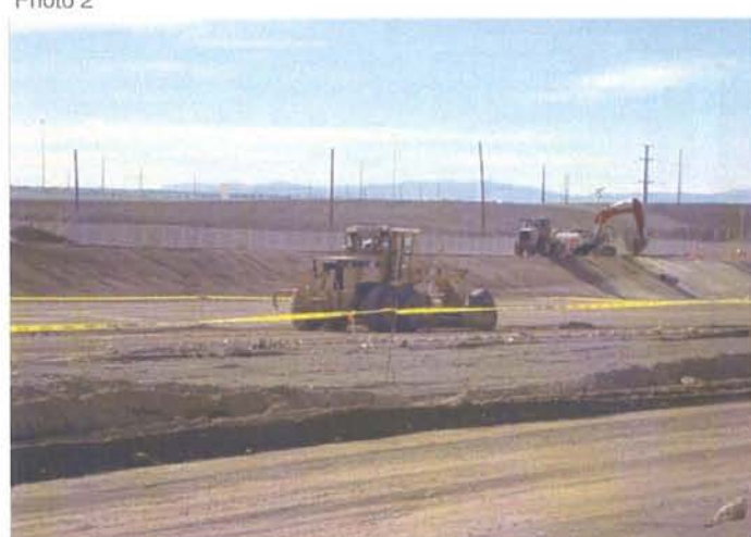
CAMU: Phase IIIA, subgrade preparation for liner.