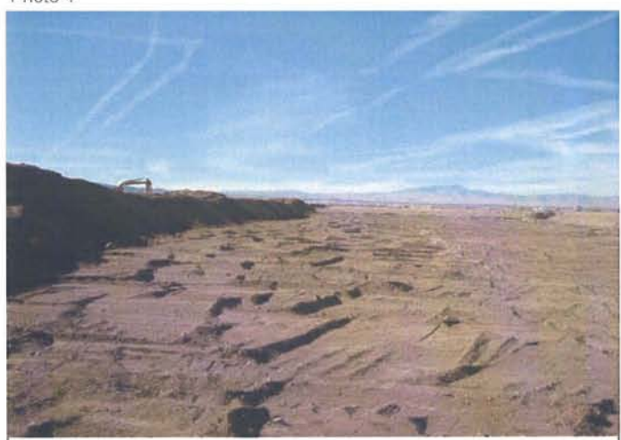
Eastside: PUB-5, additional excavation of discolored soils.