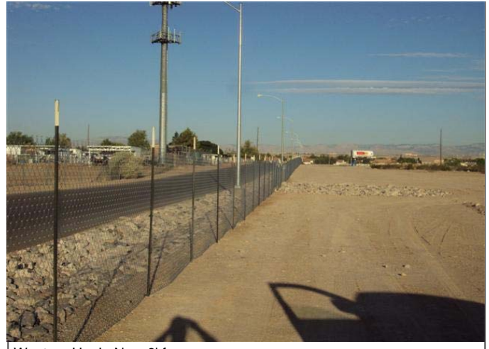
Western Hook: New 6' fence.