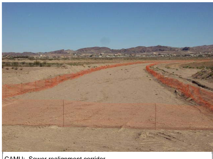
CAMU: Sewer realignment corridor.