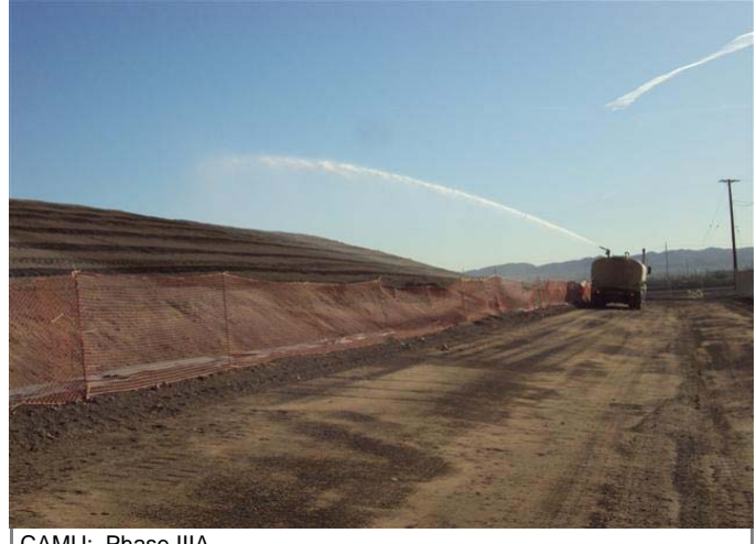
CAMU: Phase IIIA.