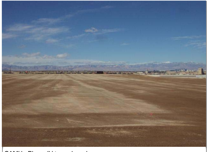
CAMU: Phase IV top subgrade.