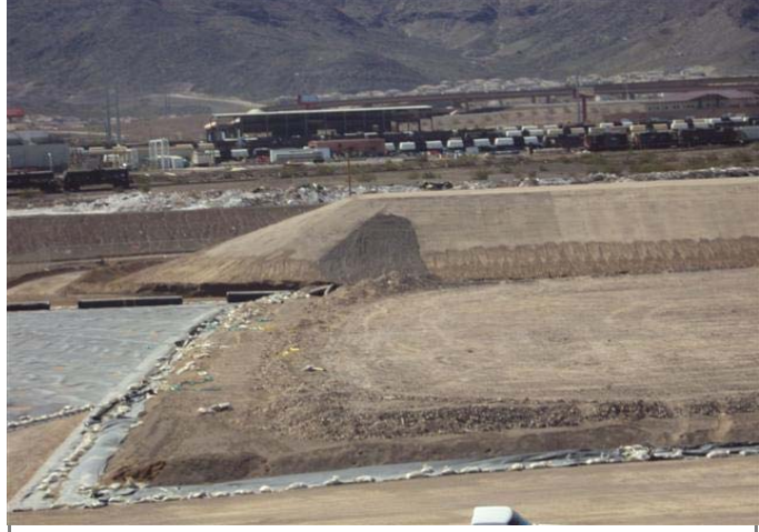
CAMU: BMI South and Phase IIIA.