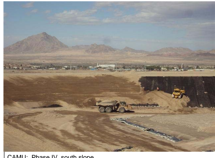
CAMU: Phase IV, south slope.