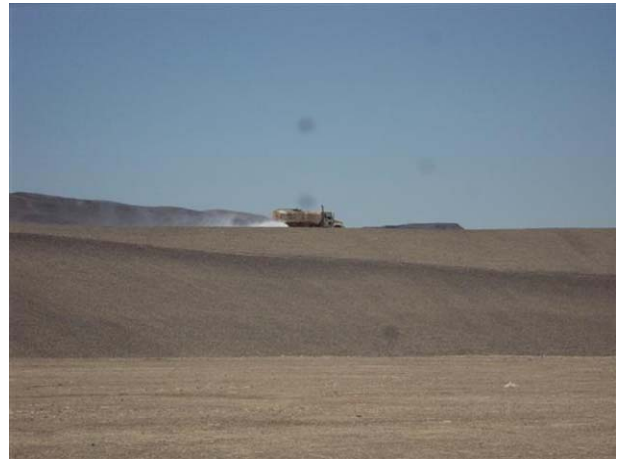
CAMU: Phase IV, placing chemloc soil binder.