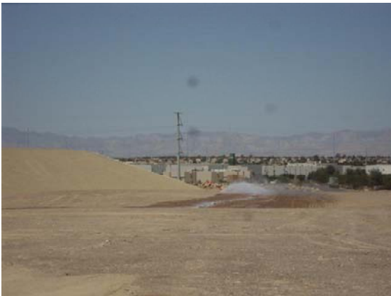
CAMU: BMI North, placing soil binder.