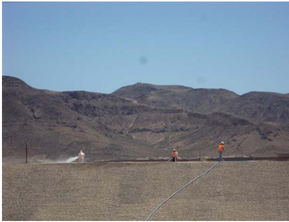
CAMU: Phase IIIA, placing chemloc soil binder.