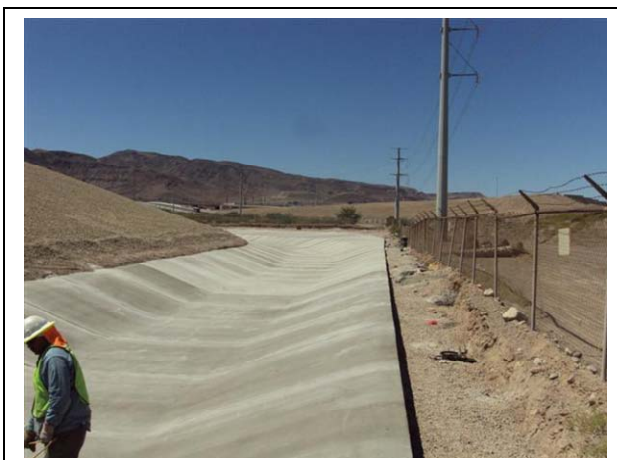
CAMU: West channel.