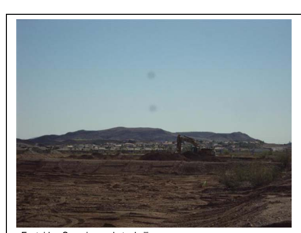
Eastside: Scraping and stockpiling.