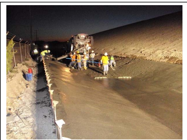
CAMU: West channel, concrete pour and finishing.