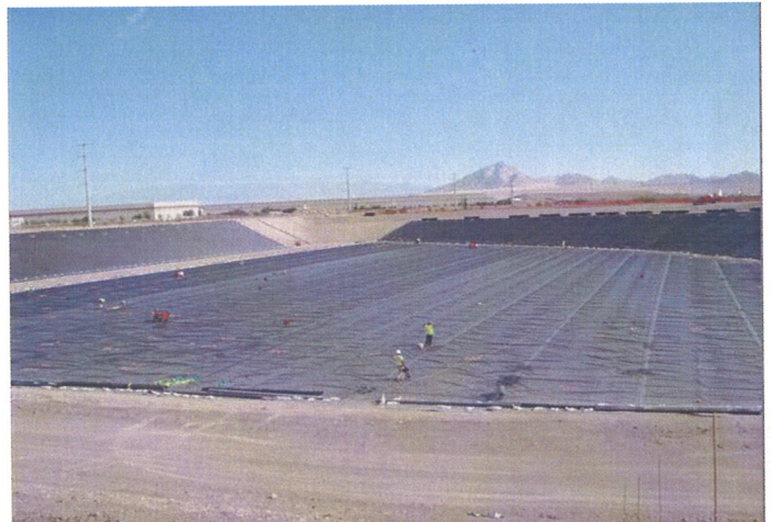
CAMU, Phase 1 Liner crew performing QC duties.