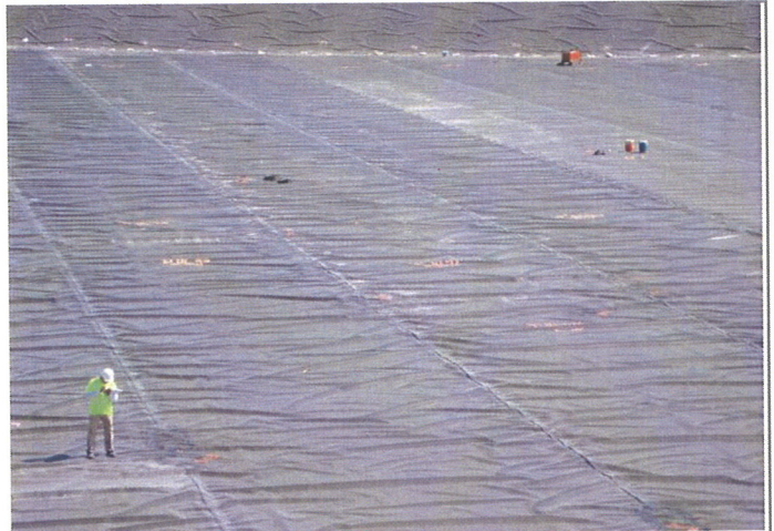
CAMU, Phase 1 Liner crew performing QC duties.