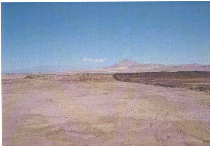
Eastside, SW-6, final scraping of slopes and floor.