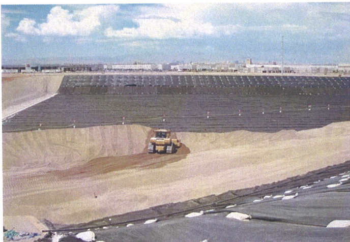
CAMU, Phase 1, Operations layer pushing out.