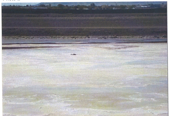
Eastside: SW-12 Pond. Water storage.