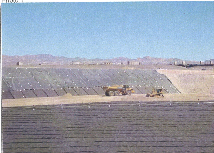
CAMU, Phase 1, Operation Layer truck backing in.