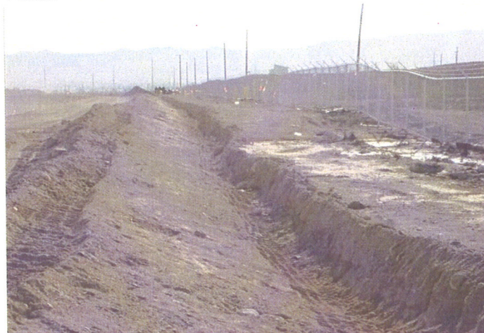
CAMU: Ditch on South side to stop run in to Phase 2.