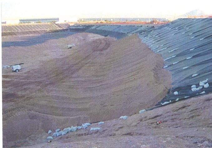
CAMU, Phase 1 East slope coverage of operations layer.