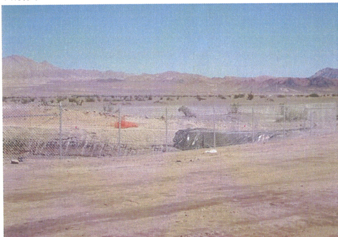
Eastside. Fence installation at crossroad sewer realignment.