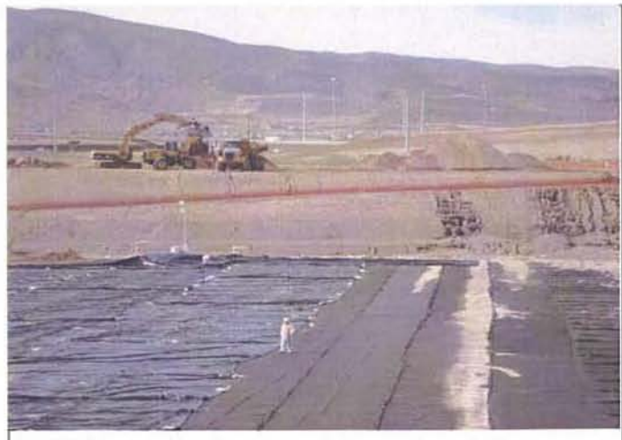
CAMU, Phase 1, Operations layer, plastic covering and silt run on.