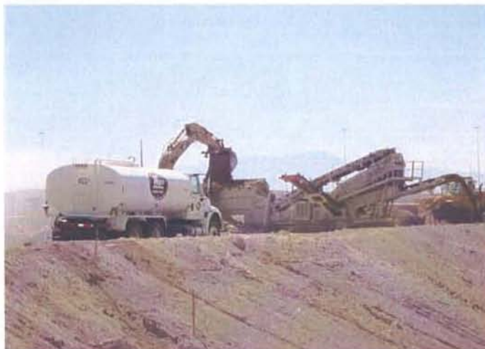
CAMU: Western Ditch Screening operation.