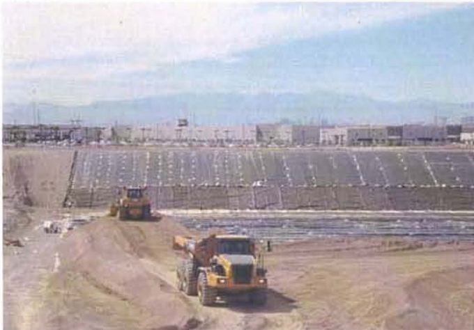
CAMU, Phase 1, operations layer placement.