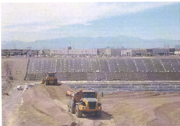
CAMU, Phase 1, operations layer placement.