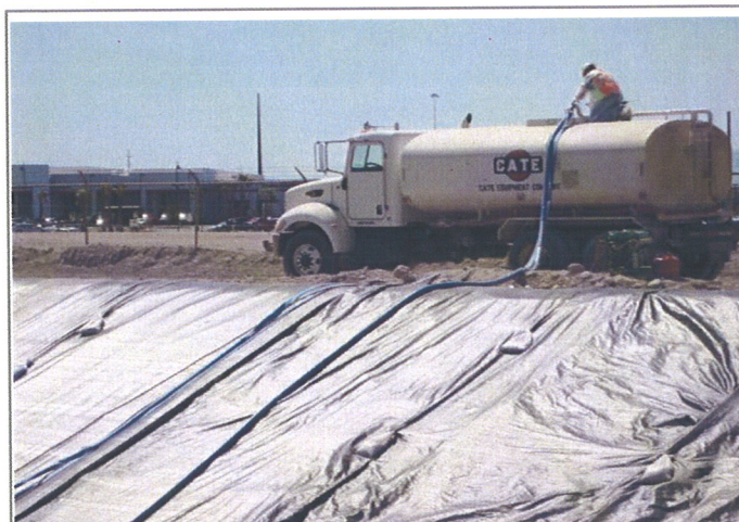
CAMU: Phase 1 dewatering sump.