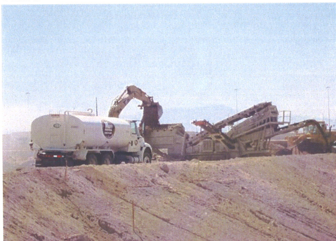
CAMU: Western Ditch Screening operation.