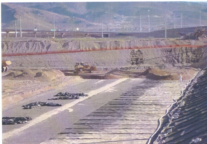
CAMU, Phase 1, Operations layer progressing west.