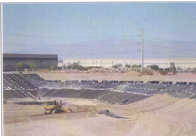
CAMU, Phase 1, operations layer placement.