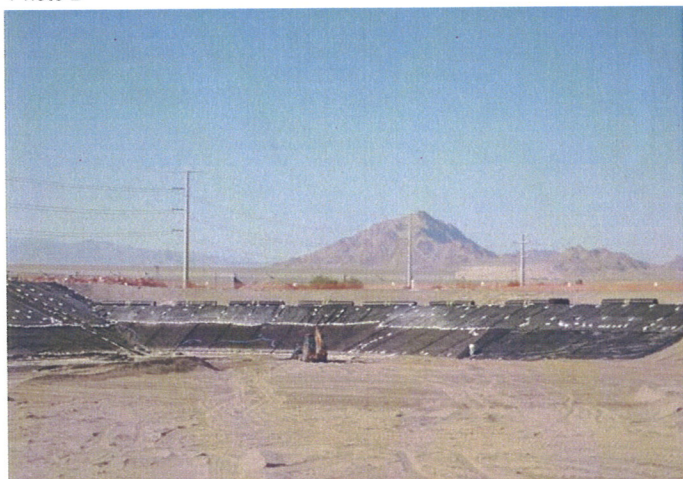
CAMU: Phase 1 operations layer placement progressing Northeast.