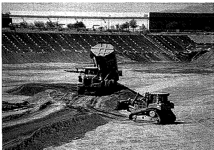
CAMU: Phase 1 operation layer second lift..