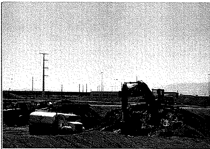
CAMU, Manual Screening,Phase 1, ops layer with dust control.