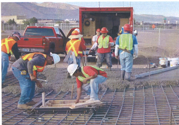
Eastside: Pouring and finishing concrete for decontamination pad..