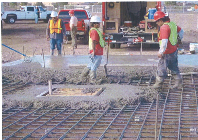
Eastside, Pouring and finishing concrete for decontamination pad.