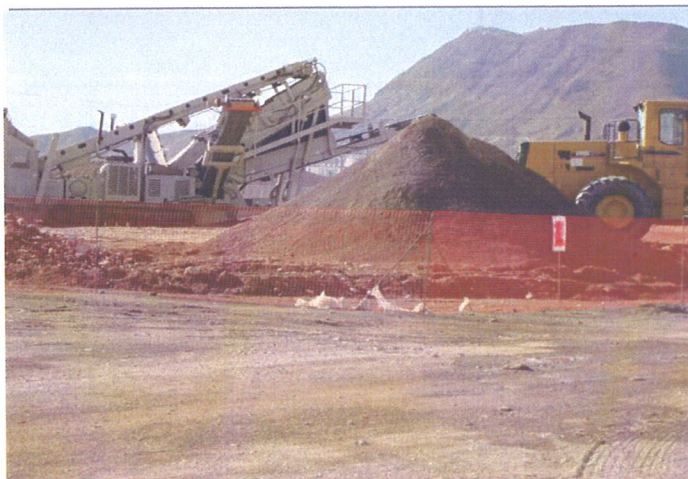
CAMU: Impacted soils at Phase 3A, being screened.