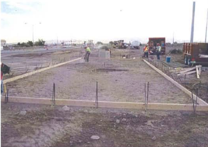
Westside: Decontamination pad being formed for concrete.