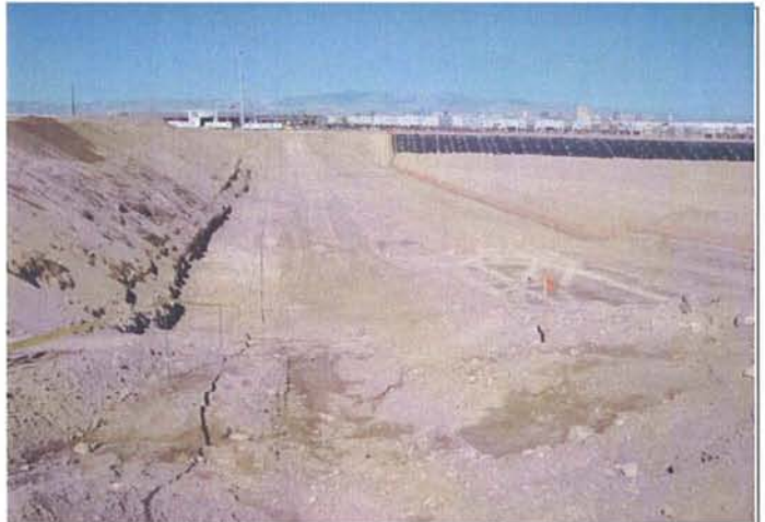
CAMU: North of Western ditch, ramp and clean soil. Has been removed next to Phase 1 south..