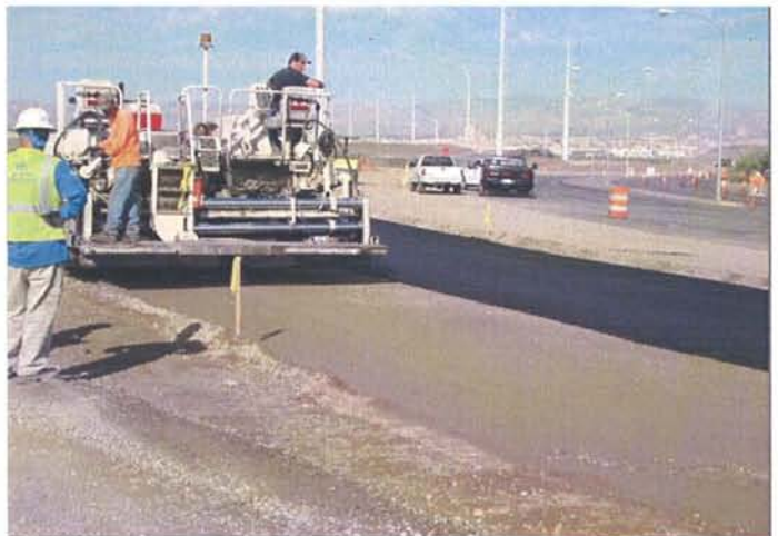
Westside of boulder hwy. exit ramp being paved for trucks returning.