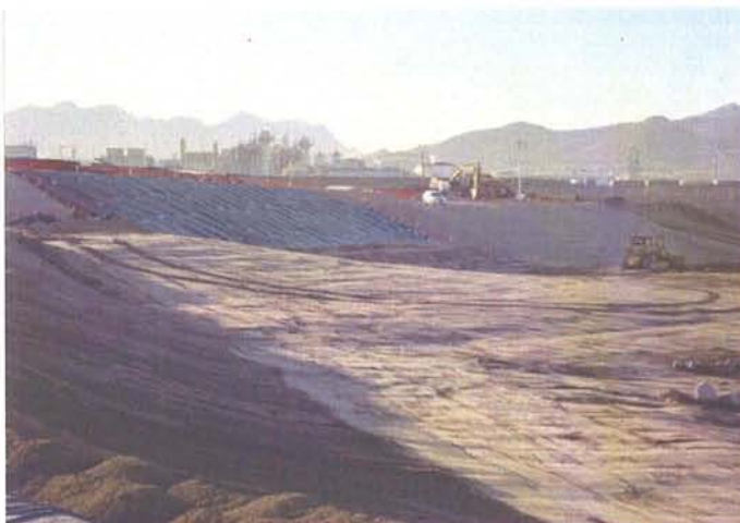
CAMU: Phase 1 Ramp in production.