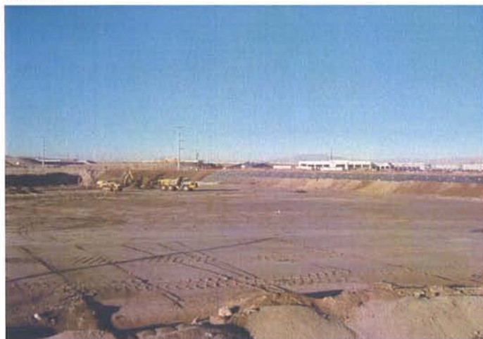
CAMU: Phase 1, West floor, looking down ramp.