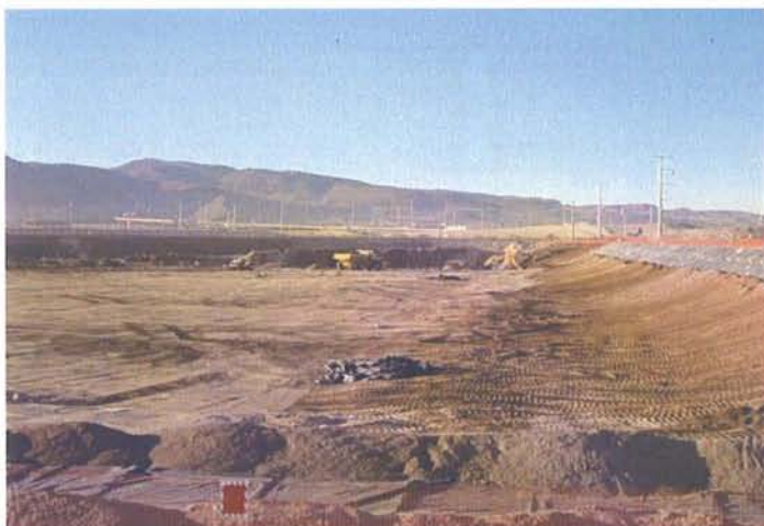
CAMU: Phase 1 West slope operations layer placed.