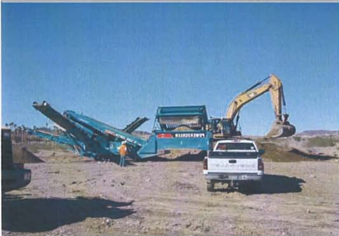
Eastside: Powerscreener at 7A dry pond area.