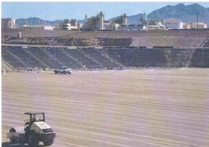
CAMU, Phase II, First day of liner installation.