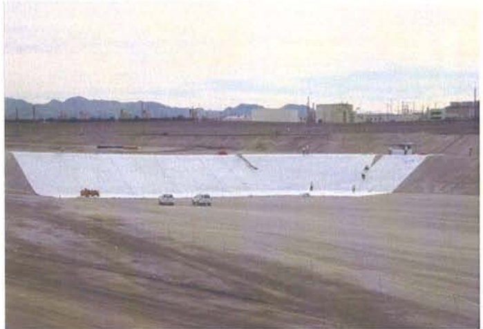
CAMU: Phase II, GCL liner deployment first day.