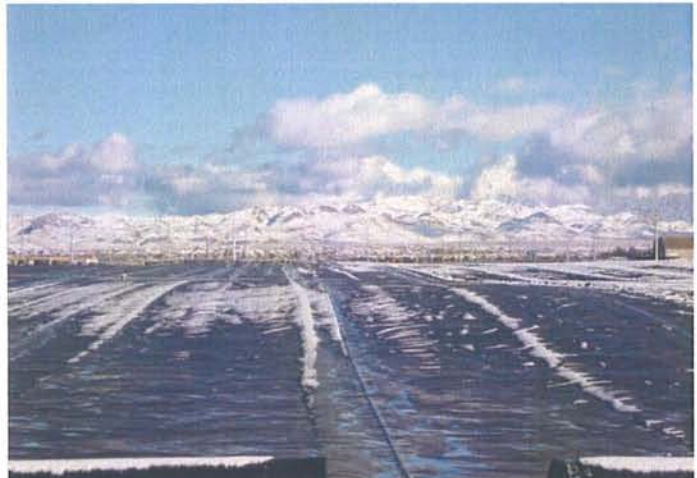
CAMU: BMI North Landfill. Now looking at black geocomposite liner.