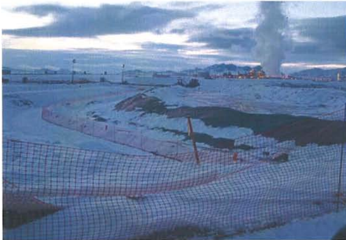
CAMU: Phase I, Northend.