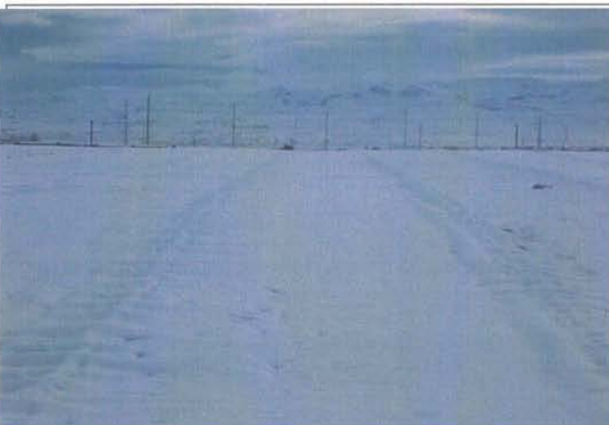
CAMU: BMI North Landfill. Looking at black geocomposite liner