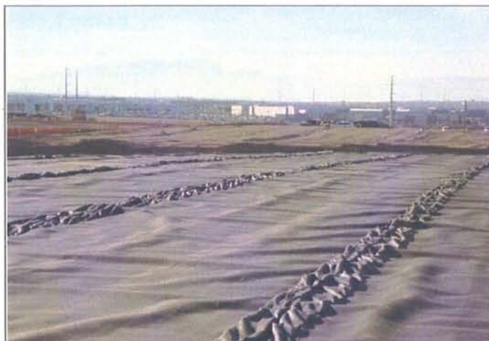
CAMU: BMI North Landfill geocomposite and first cover layer of 1" minus soils.