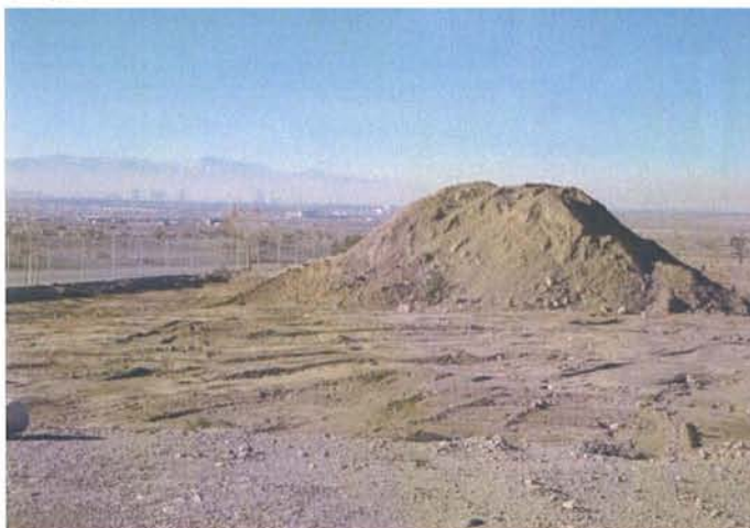
Mohawk, surficial scrape.