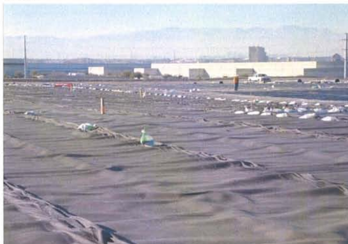
CAMU: BMI North Landfill geocomposite layer.