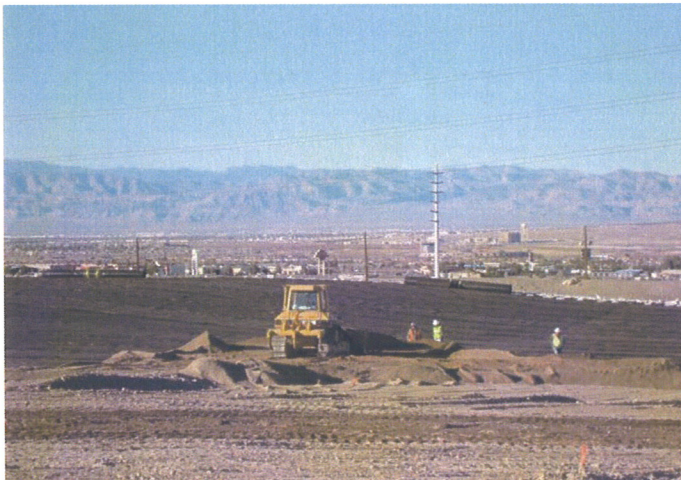
CAMU: Placing 1" soils on North BMI Landfill.