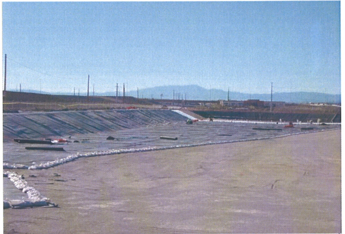
CAMU: Phase IIA Liner installation.