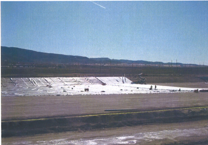
CAMU: Phase IIIA, Liner installation.