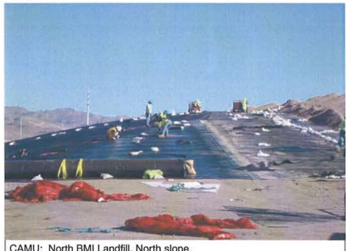
CAMU: North BMI Landfill. North slope.